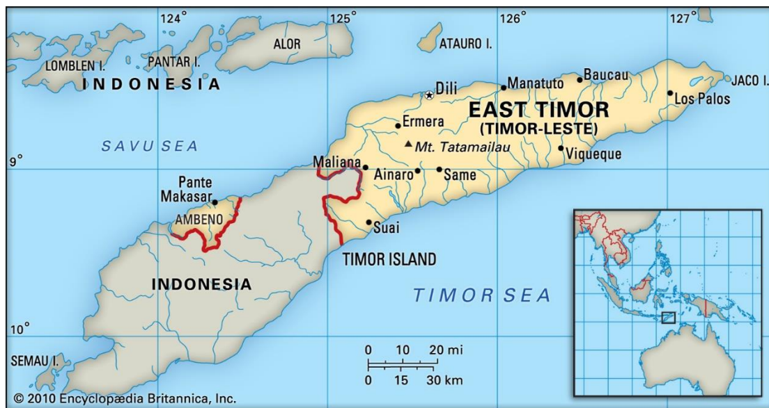
Figure 1: Map of Timor Leste

the most-eastern part of the Lesser Sunda Islands. 90 It is bordered with Australia and Indonesia to which it occupies an area of 14,874 km 2 . It is inevitable that Timor Leste lies upon the region of Southeast Asia, which indefinitely fulfills the first requisite of joining ASEAN under the Charter. Figure 1 below displays the location of Timor Leste in the region of Southeast Asia: